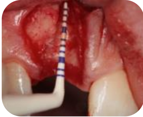
Cortical plate defect measurement