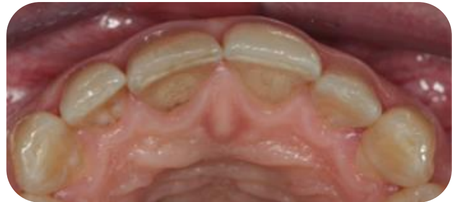
Clinical view (occlusal view)