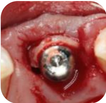
CTG from tuberosity