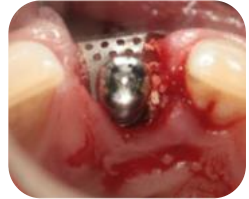
i-Gen (occlusal aspect)