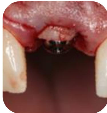
Placed 1 mm above gingival margin