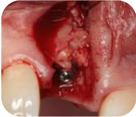
Bone chips from tuberosity