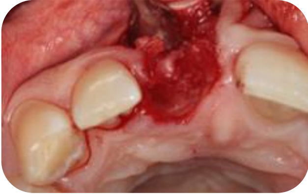
Mucoperiosteal flap raised