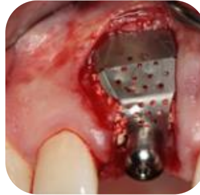
i-Gen (labial aspect)