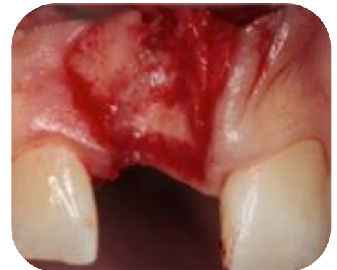
Single vertical incision