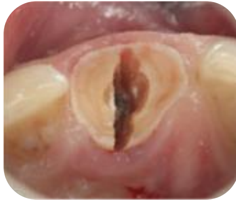
Atraumatic extraction (occlusal view)