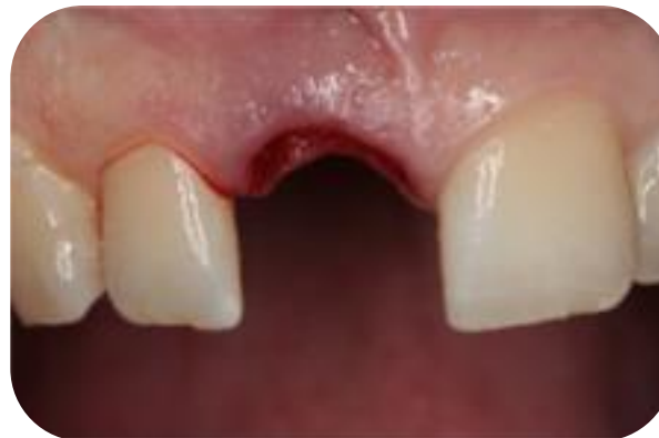
Alveola (labial view)