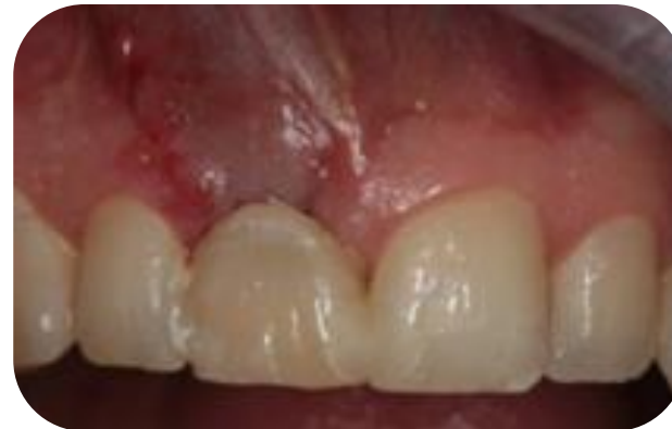
Natural tooth adapted to new local conditions (7 days after surgery)