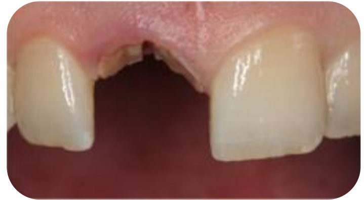
Atraumatic extraction (labial view)