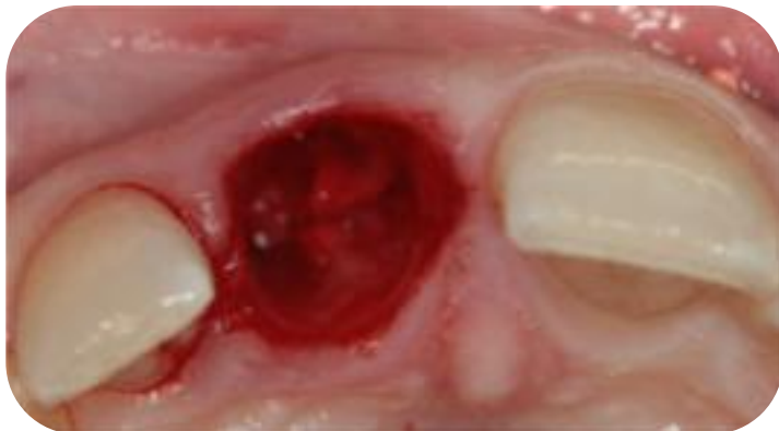
Alveola (occlusal view)