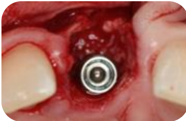
Implant palatal position