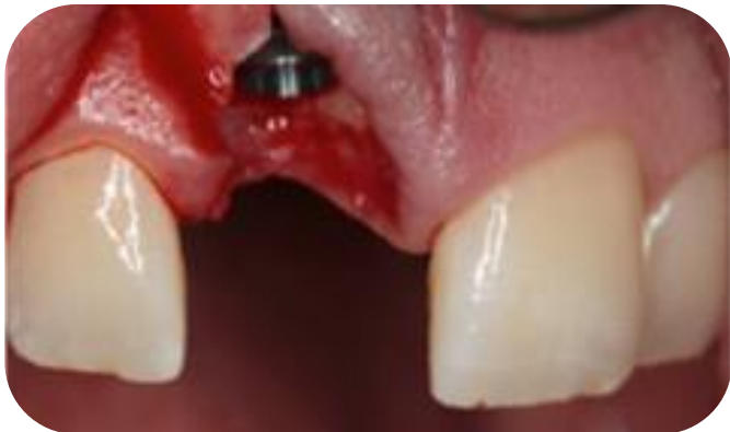
Implant in place