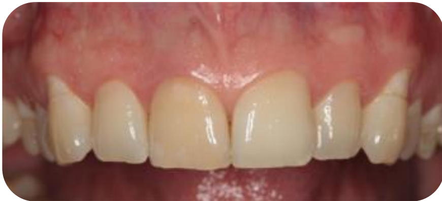
Clinical view (labial view)